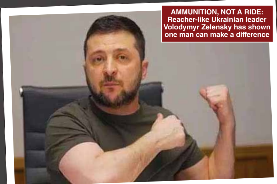
AMMUNITION, NOT A RIDE: Reacher-like Ukrainian leader Volodymyr Zelensky has shown one man can make a difference